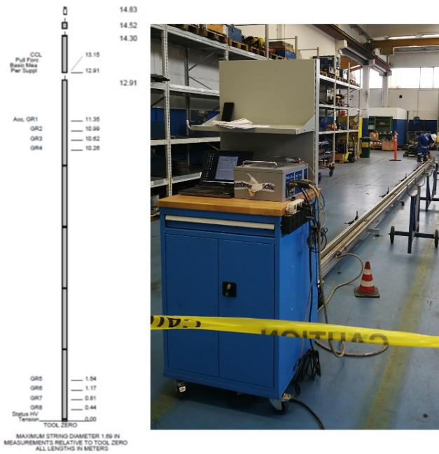
Figure 2. The FSMT logging tool.

between 240 and 420 mm from the casing. Out of this interval, the signal is either too low or influenced by the casing presence.