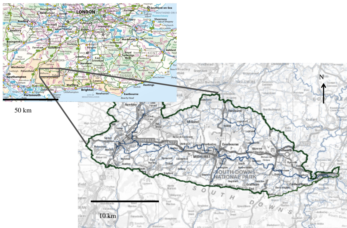
Figure 1. River Rother Catchment is located in the South Downs National Park with Midhurst at the centre (Edina Digimap, 2014; South Downs National Park Authority, 2015).

soil health. A reduced rate of water infiltration into the soil, or soil capping, increases the flashiness of surface runoff and increases sediment detachment and transport (Boardman and Favis-Mortlock, 2014). If the soil has a reduced infiltration capacity, excess water can create muddy flows that run across the land and into rivers, thereby increasing flood magnitude (Boardman and Favis-Mortlock, 2014).