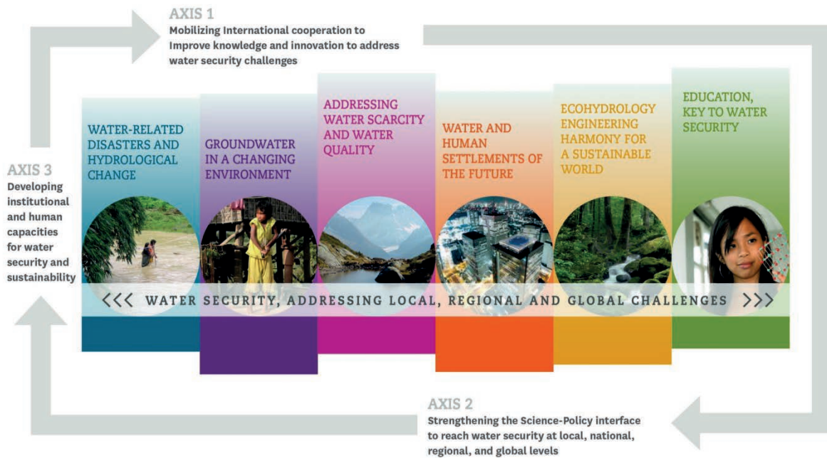
Fig. 1 Overview of themes and action axes of IHP-VIII, Water Security: Responses to Local, Regional and Global Challenges (2014–2021).