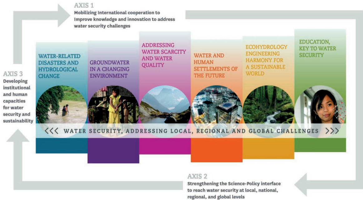
Fig. 1 Overview of themes and action axes of IHP-VIII, Water Security: Responses to Local, Regional and Global Challenges (2014–2021).